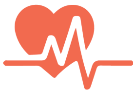
Vital Signs Machines $307,982

The success of the fiscal year 26 Emergency Department Campaign reflects the generosity of donors throughout Lennox and Addington who understand the importance of accessible, high-quality emergency care. Together, these contributions are helping ensure patients and families continue to receive the best possible care when they need it most.