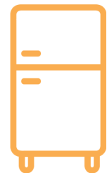
Medication Fridge $10,834