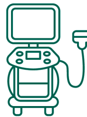
Bedside Ultrasound $65,848