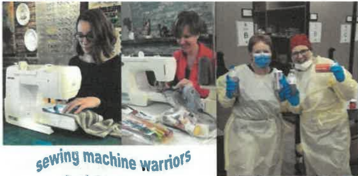
sewing machine warriors for L&A Hospital